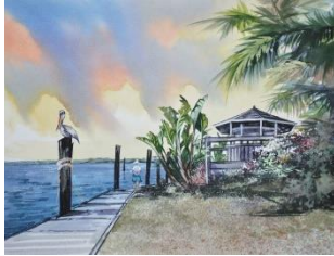
Friday, January 6

Workshop location Waldo Peppers 4046 E Harbor Rd, Port Clinton OH, 43452 Discounted lodging available for students by mentioning the Port Clinton Artists' Club at Holiday Inn Express & Suites Port Clinton-Catawba Island 50 NE Catawba Road Port Clinton, OH 43452 419-732-7322