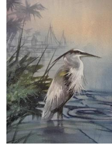
Sunday, January 8